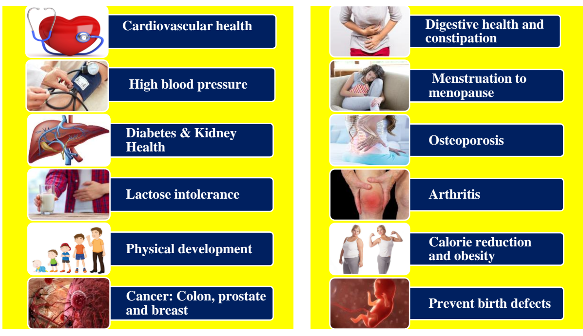
Figure 1. Health- promoting benefits of soy-based food products.

It has also been demonstrated that isoflavone aglycones are absorbed faster and in greater amount than their glycosides in human intestines. Fortunately, deglycosylation of isoflavones can be achieved during fermentation process by several strains such as lactic acid bacteria, basidiomycetes, filamentous fungus, and Bacillus subtilis with their \beta -glucosidase activity.